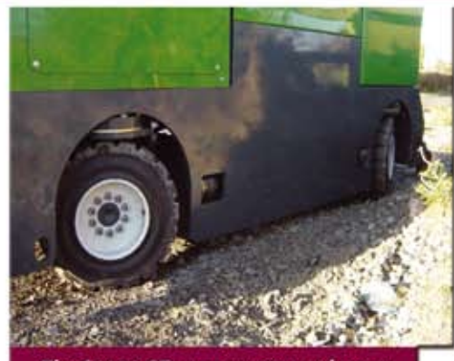
The C6000 GT can operate outdoor on semi-rough terrain as well as indoors.